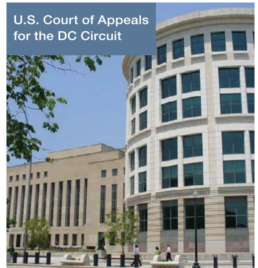
U.S. Court of Appeals for the DC Circuit

On June 8, IRLI demonstrated that American workers do have a good lawyer, when it scored an important legal victory on behalf of American tech workers before the U.S. Court of Appeals for the District of Columbia Circuit. Representing the Washington Alliance of Technology