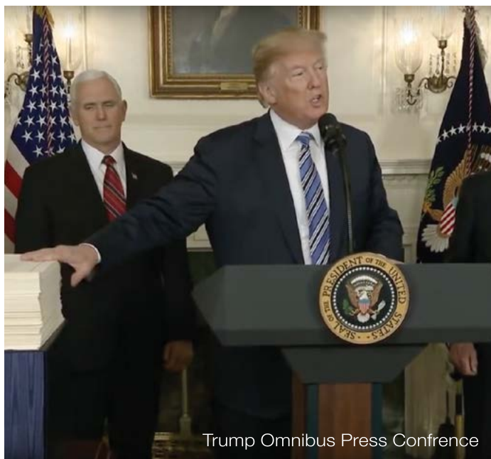
Trump Omnibus Press Conference

And while adequate funding for the wall was not included, powerful business interests are inappropriately using the spending bill to expand their access to cheap foreign labor. Congressional leadership included a provision in the omnibus that allows the Department of Homeland Security to double the number of H-2B visas available in the current fiscal year. Opening the door for a significant increase in guest workers is not only unwarranted, but harmful to the interests of American workers.