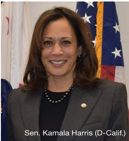
Sen. Kamala Harris (D-Calif.)